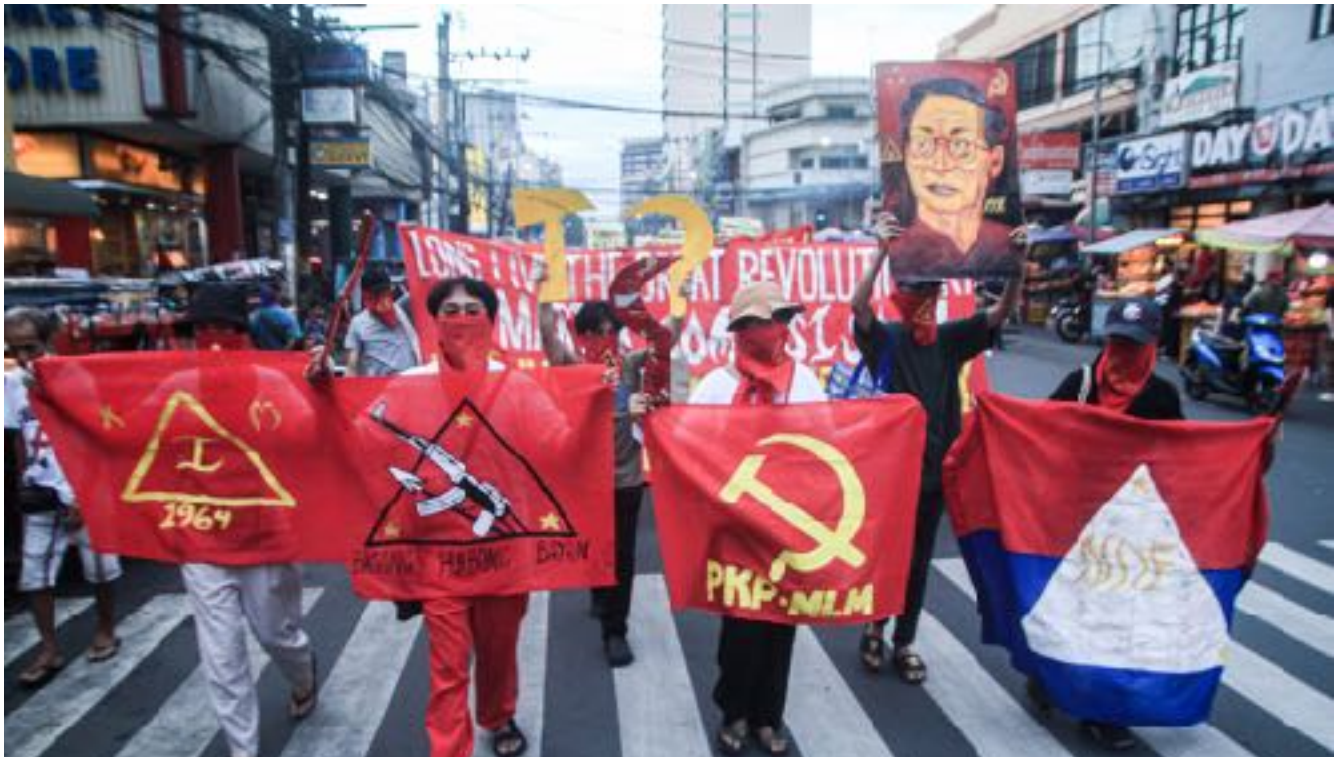
Kabataang Makabayan members stage a lightning rally in Manila to honor Ka Joma on December 21, 2022

Guide to Land Reform in September 1972 which both served to direct the work of building the mass organizations, organs of political power, units of the people's army and the Party, as well as in mobilizing the peasants in waging agrarian revolution. He authored the Preliminary Report on Northern Luzon in August 1970 which served as a template in the work of other regional committees.